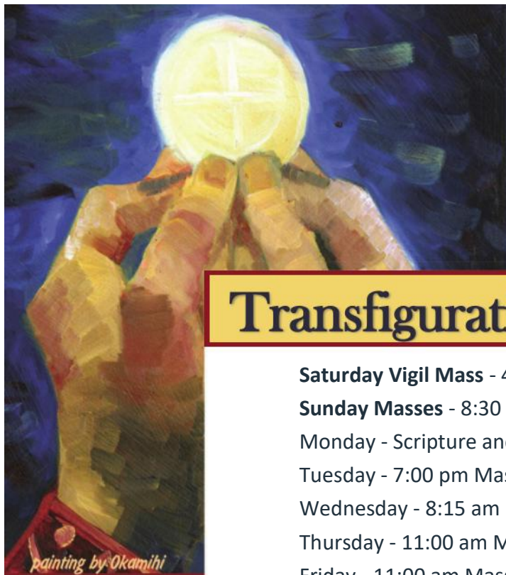
painting by Okamihi

How can I repay the Lord for all the good done for me? I will raise the cup of salvation and call on the name of the Lord. I will pay my vows to the Lord in the presence of all his people. Lord, I am your servant.