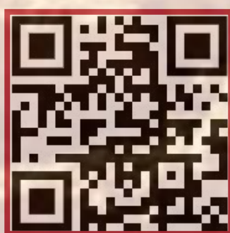
Diocese of Toledo: Scholarship Fund (SGO)