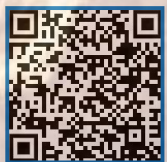
St. Peter Catholic School: Enrollment Application

Kindergarten screening will take place on April 12th . Children 5 years old by August 1st are eligible to apply.