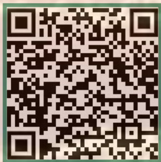
EdChoice Scholarship: Information

Student seats are limited so get your name on the list of interested families by applying today. Scan the links below for more information or call St. Peter Catholic School at 419-294-1395 .