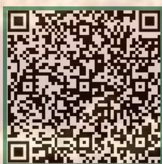
EdChoice Scholarship: Application Form 2025